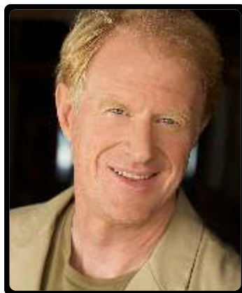
Ed Begley Jr.

On television, Begley is appearing in the new US CBS comedy called "Gary Unmarried" He has also been seen recently in "Recount" with Kevin Spacey, Tom Wilkinson and Laura Dern, as well as recurring roles on "Six