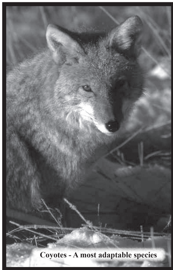
Coyotes - A most adaptable species

The only consolation is the fact that western nations are all in much the same place. Hung parliaments; deep divisions between political parties; political refusal to listen to the people or put in place policies which are what the voting public want. In the US, the Republican dominated Congress has held up funding the Government for weeks and weeks. Funding is granted for two week periods and then the fight starts again. Many critically important US agencies have no ability to budget, plan, continue research or institute any new programs. It's almost total deadlock, stalemate in the world's only super power.