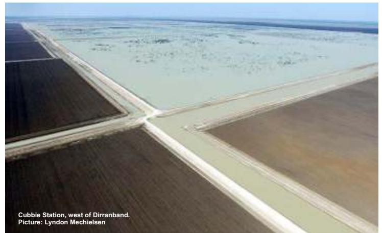
Cubbie Station, west of Dirranband.

Cubbie is managed by the Lempriere Group, on behalf of CS Agriculture, a joint venture between Lempriere and Shandong Ruyi, a textile manufacturer owned by investors from China and Japan.