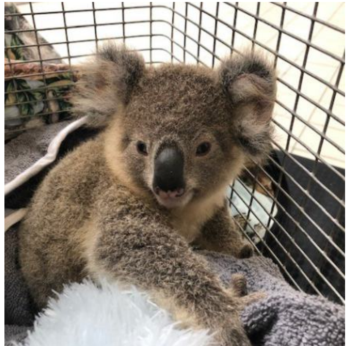
Orphan Annie - a 9 month old orphan joey rescued by Queensland Koala Society.

AFA has officially adopted the New England Wildlife shelter in Tenterfield. We will supply food for a growing number of starving animals on an ongoing basis.