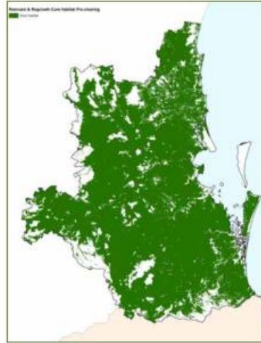
Pre-clearing (1960s) koala habitat extent

When the assembled audience at the meeting was asked : ' What do you consider is the main threat to koalas?', AFA responded – “ Politicians”. That's the reality.