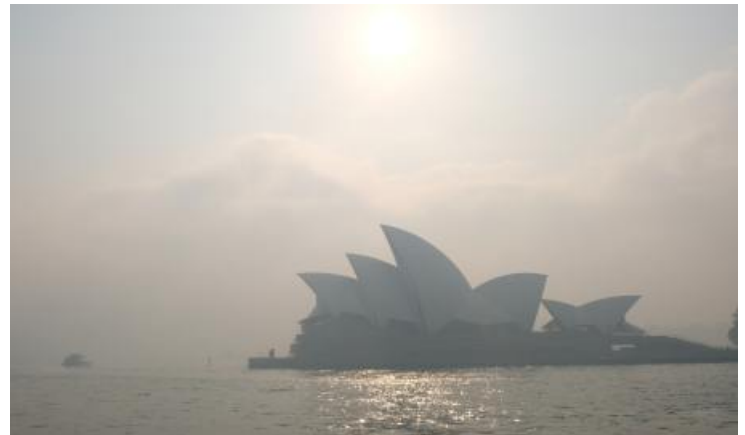
Sydney, NSW, Australia - November 20th 2019: Smoke over Sydney due to bush fires on edge of city.

We are living in an ancient land, a land which international and national scientists have predicted over and over again would be highly vulnerable to major climate impacts.