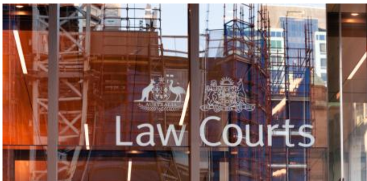
Sydney, Australia - July 19, 2019: Supreme Court of New South Wales

AFA continues to work tirelessly trying to get a legal challenge to stop the looming loss of southwest Sydney koalas.