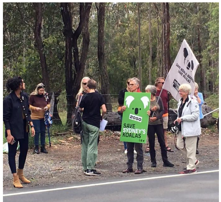
Protesters at the site of the Figtree Hill construction site in January

"We have the strongest record on environment anywhere in the country. Our policies in relation to climate change, emission reduction, national parks, we have led the country on these policies."